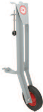
Optional EZ lift for loading into vans or trucks.