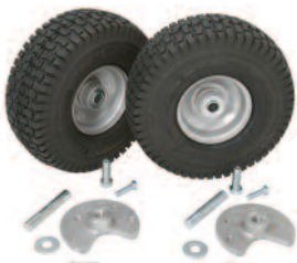
Optional pneumatic wheel kit.